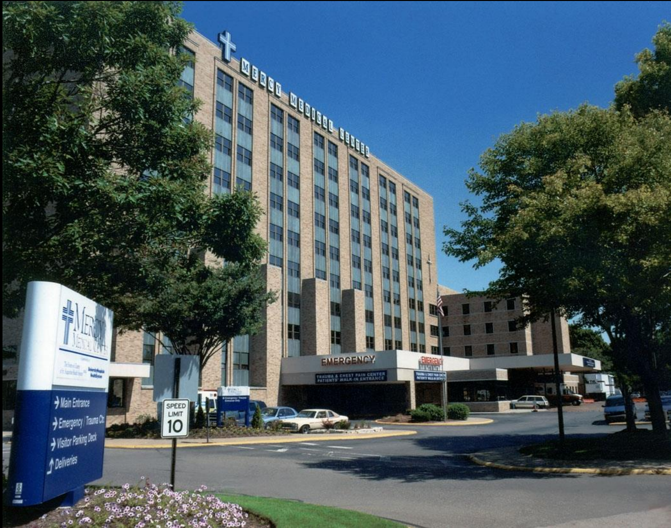
Mercy Medical Center